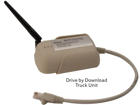
Drive by Download Truck Unit

The Drive by Download™ is a Wi-Fi data transfer system that collects, downloads and compiles application data. Transferring data using Drive by Download™ involves a truck-mounted wireless bridge and antenna that communicates with a wireless access point or base station mounted in your facility. The operator drives within a 250-foot radius of the base station and data is automatically transferred for later analysis and reporting, resulting in usable information that can help you make effective decisions to improve overall operations.