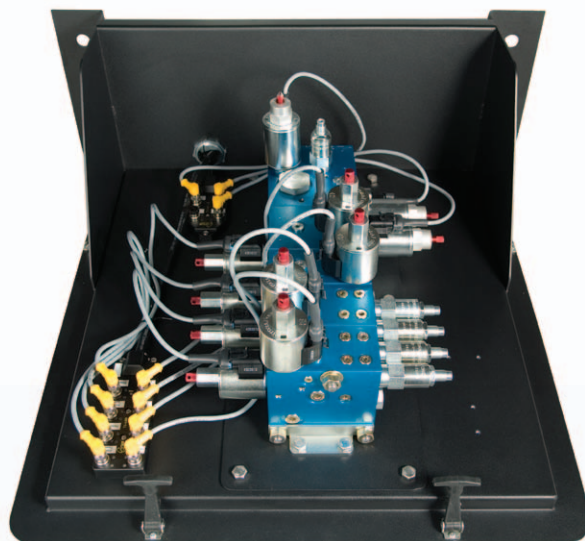
Modular Manifold Valve Assembly