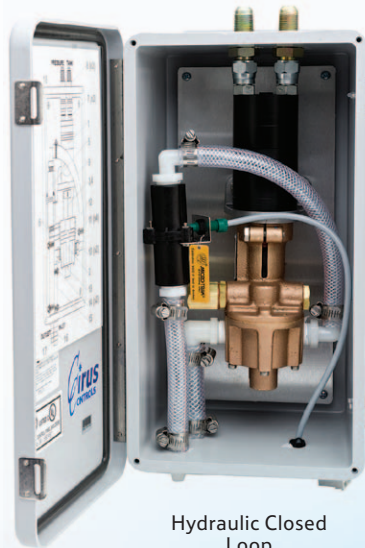
Hydraulic Closed Loop