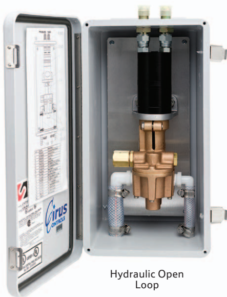
Hydraulic Open Loop